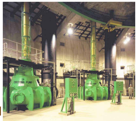
Main Sewage Pumps 18,720m 3 /h - 37.3m - 2,500kW - 8units